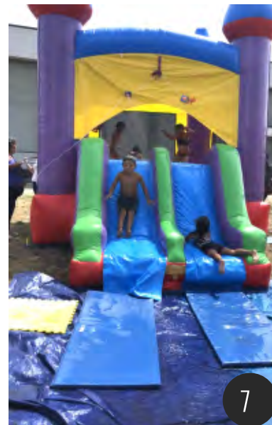
Health Summer Feast and Tsawout Summer Camp wrap up with the Vancouver Chinese Baptist Church